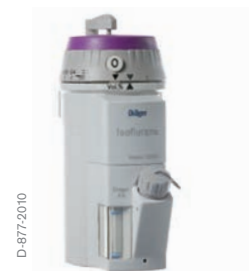
D-877-2010 Dräger Vapor 2000 - isoflurane

When set in transport position, both the Dräger Vapor 2000 and the D-Vapor can withstand tipping or even being turned upside down without any ill effects. The anesthetic agent remains safely contained within the vaporizer. After connecting the vaporizer and releasing the transport position, they are immediately ready for operation according to specification.