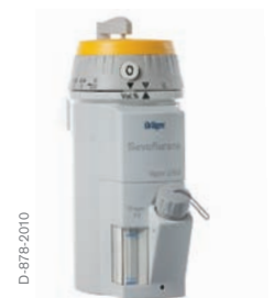
D-878-2010 Dräger Vapor 2000 - sevoflurane