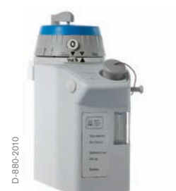
D-880-2010 Dräger D-Vapor - desflurane