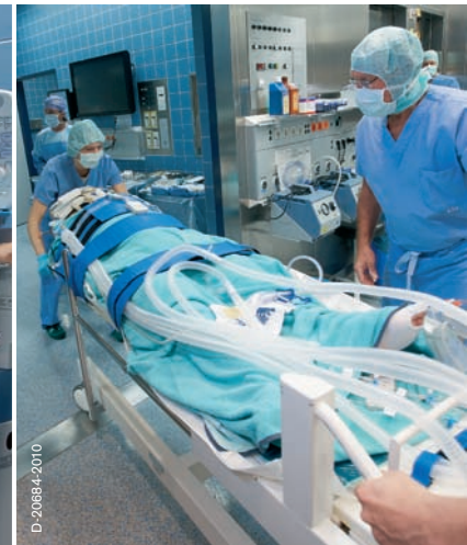
Patient transport Transport patient into the MRI-OR