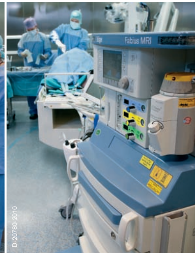
Neurosurgical MRI-OR Anesthesia maintenance phase. Patient monitoring during MR sequences (Anesthesia Device, Patient Monitor, Syringe Pumps)