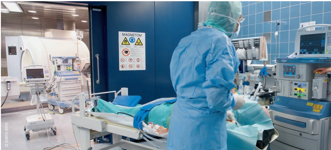
Induction Room Induction of anesthesia in a patient before entering the Neurosurgical MRI-OR